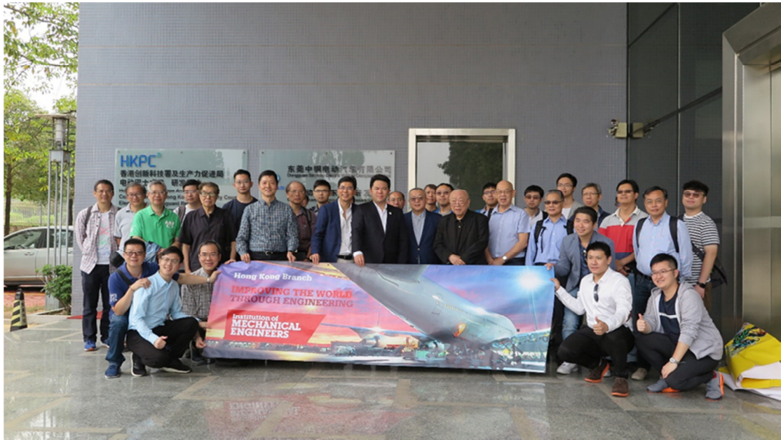
Figure 3 Delegation at China Dynamics