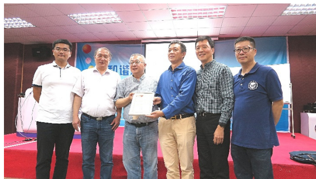
Figure 2 Presentation of Certification of Appreciation to GHEST

All members found the two visits to eye-openers, and a lot of interactions were seen at the Q&A sessions. We would like to thank HAESCO for organizing the visits, and all members for their eager participation.